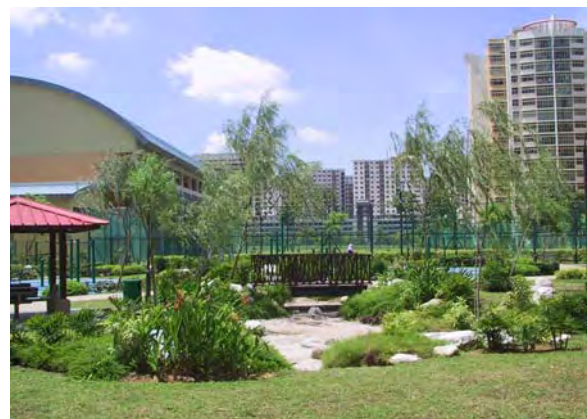
VersiTank® Infiltration System and the completed 'Rain Garden'