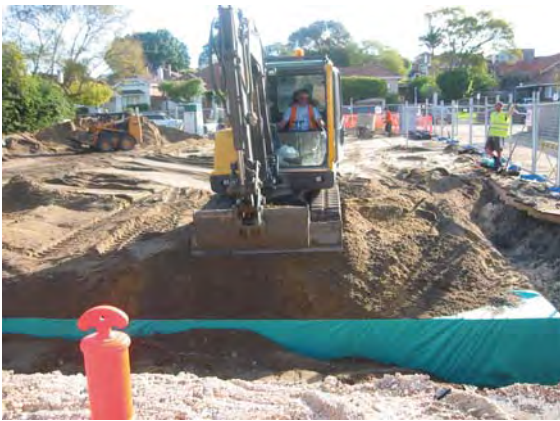
VersiTank® Infiltration System installed under a car parking area