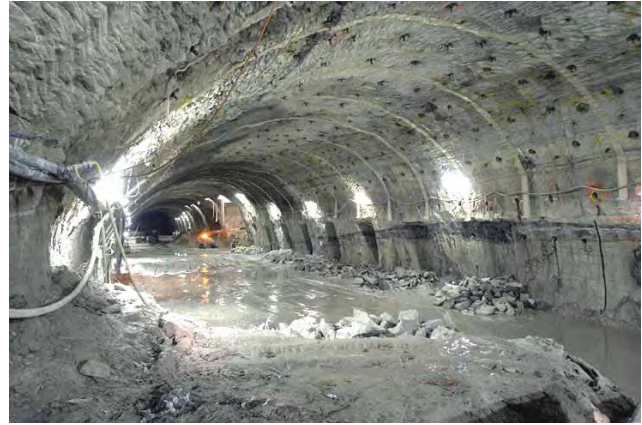
VersiDrain 8 Mesh provides efficient drainage of tunnels and internal basement walls

VersiDrain® 8 Mesh is manufactured and tested according to DIN 18 195, DIN 4095, DIN 4102, DIN 53 576 and BS 8102.